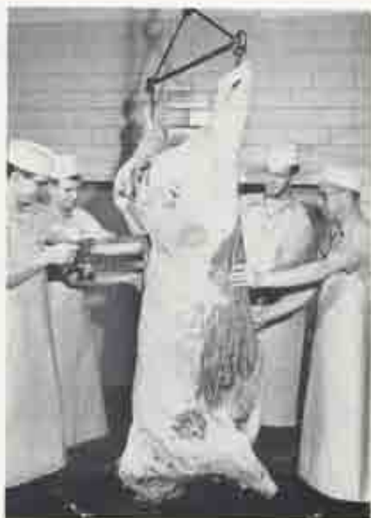
(Right) Agricultural College students gain practical experience in slaughtering meat animals and in cutting and curing meats.