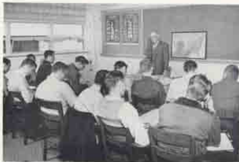
(Above) Lecture sessions for meats classes are held in this airy classroom which is equipped with many modern teaching aids.